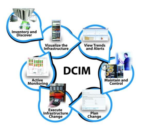
Figure 1. Logical diagram of DCIM

DCIM is application software that inventories data center facility and IT assets and merges physical layer data with monitoring data collected from those assets. DCIM may include hardware, although ideally no new hardware should be required by a DCIM solution to manage existing assets.